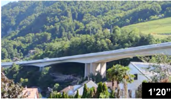
Waterstops for securing anchored foundations of the Chillon viaduct