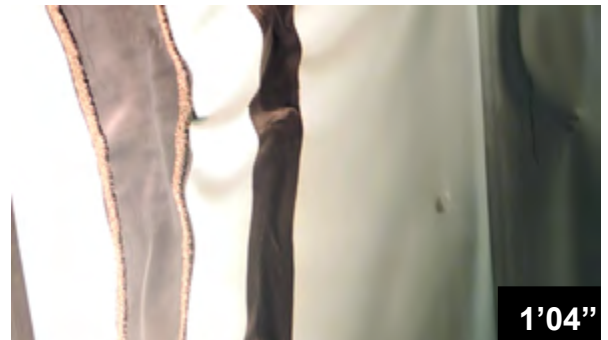
Waterproofing joints in the Choidez tunnel