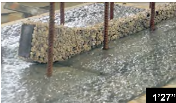
Placing of bands BFL-Mastix type R4 into fresh concrete