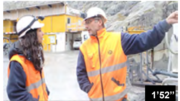
Expansion joint during the height increasing of the Vieux Emosson power dam