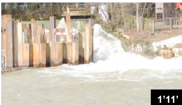
Waterstops in the construction of a hydro-electric station