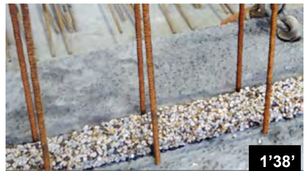
Horizontal gluing of bands BFL-Mastix type R