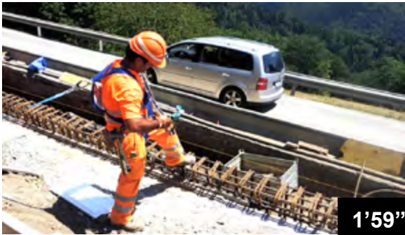
Height increasing a wall of a mountain road