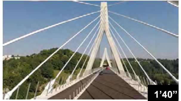
Waterproofing curbside joints on the « la Poya » bridge