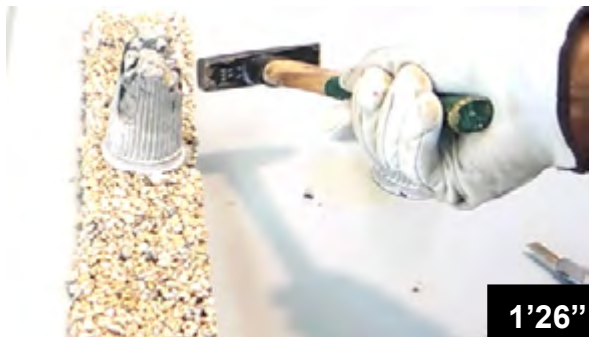
Adherence of fresh concrete