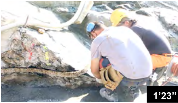
Gluing of BFL-Mastix bands on rock