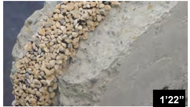
Gluing of BFL-Mastix bands on an irregular surface