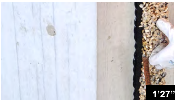
Vertical gluing of BFL-Mastix bands type R4 1/2 D