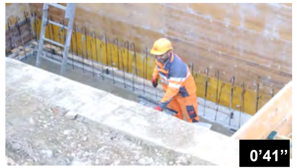
Very high waterproofing requirements