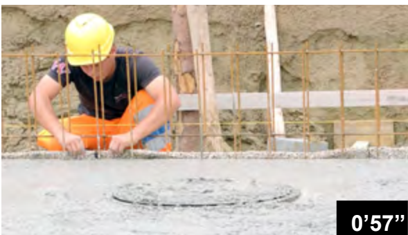
Incorporating BFL-Mastix waterstops in fresh concrete of a raft