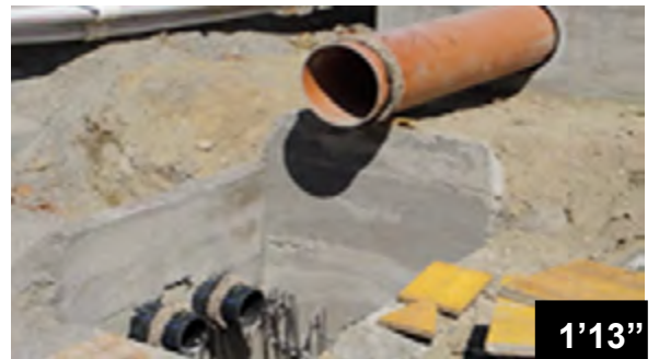
Gluing of BFL-Mastix bands on PVC pipes