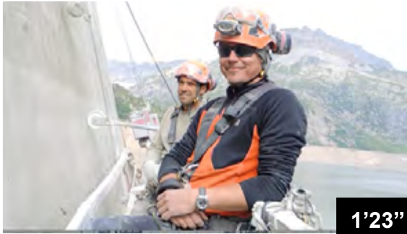
Treating a saw cut joint on the water side of dam Emosson