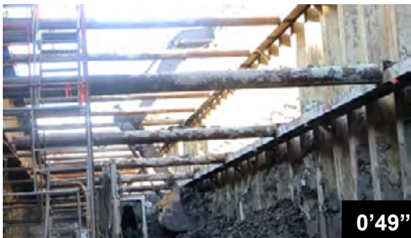
Waterproofing joints in a concrete retention basin in Marc Aurèle Fortin street