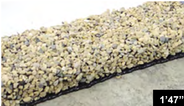
Gluing of BFL-Mastix bands on Concrete